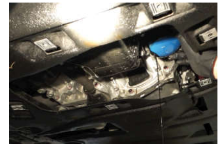
6. UNSCREW THE OIL FILTER . FIRST , TRY BY HAND THE GET A GOOD GRIP AND TWIST SLOWLY AND STEADITY , COUNTER -CLOCKWISE . IF YOU ARE UNABLE TO REMOVE THE FILTER BY HAND . YOU WILL NEED AN OIL FILTER REMOVAL TOOL TO DO THIS .