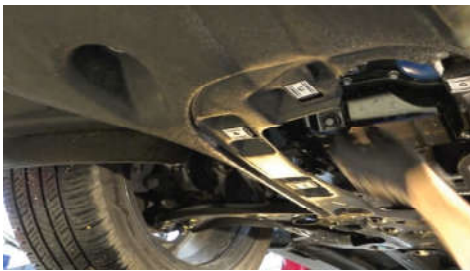
4. FIND THE ENGINE DRAIN NUT , VERIFY THAT IS THE ENGINE OIL DRAIN NUT , NOT THE TRANSMISSION DRAIN NUT