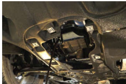
5. REMOVE THE OIL NUT . LOOSEN THE NUT COUNTER-CLOCKWISE USING THE PROPER SIZED AND REPLACE A FELT DRAIN NUT GASKET .