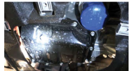
3. YOU WILL SEE OIL FILTER AND DRAIN NUT