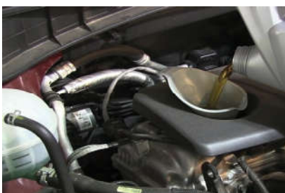
10. FILL THER NEW ENGINER OIL BE SURE TO USE THE MANUFACTURER - RECOMMEND GRADE AND VISCOSITY OF ENGINE OIL AND START THE ENGINE FOR TEST LEAK ABOUT 5 MINUTES