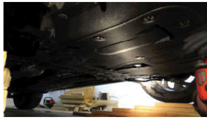
2. UNSCREW THE PROTECTOR PAD ( PLEASE CHECK THE VEHICLE MAUNAL )