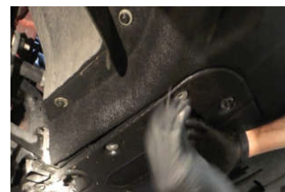
11. INSTALL THE PROTECT PAD TO THE BASE