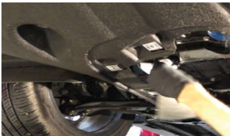
7. IT WILL TAKE SEVERAL MINUTES FOR ALL THE OIL TO DRAIN OUT OF THE CAR . PUT THE NEW GASKET FELT ON THE DRAIN NUT AND PUT THE DRAIN NUT TO ENGINE