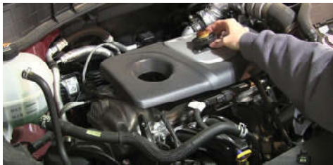
1. REMOVE THE OIL CAP , OPEN THE HOOD AND LOCATE THE OIL CAP OIN TOP OF THE ENGINE