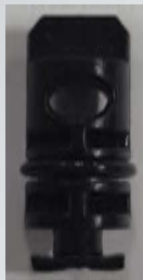
Car Plug with small O-ring