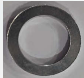
Oil Pan Plug Washer