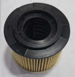
Oil filter#26350-2M000 Brand : CORNER

1. Kindly ensure that the provided package contains a full complement of parts necessary for oil filter servicing